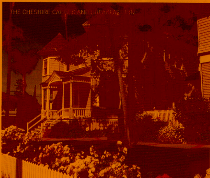
THE CHESHIRE CAT BED AND BREAKFAST INN

England. Continental breakfast is served daily in the main house. Each room is uniquely designed with a lovely view of Santa Barbara. Three individual cottages are also available for monthly rentals. www.cheshirecat.com . 36 W. Valerio Street. Santa Barbara, 805/569-1610