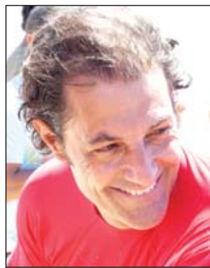
Shaun Tomson shows off his new children's project in Washington, D.C.

Former world champion surfer and environmentalist Shaun Tomson has been promoting his first children's book "Surf Creatures," about creatures that live under his surfboard.