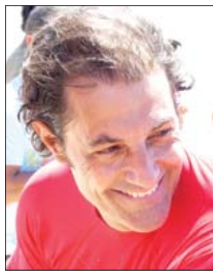
Shaun Tomson shows off his new children's project in Washington, D.C.

Former world champion surfer and environmentalist Shaun Tomson has been promoting his first children's book "Surf Creatures," about creatures that live under his surfboard.